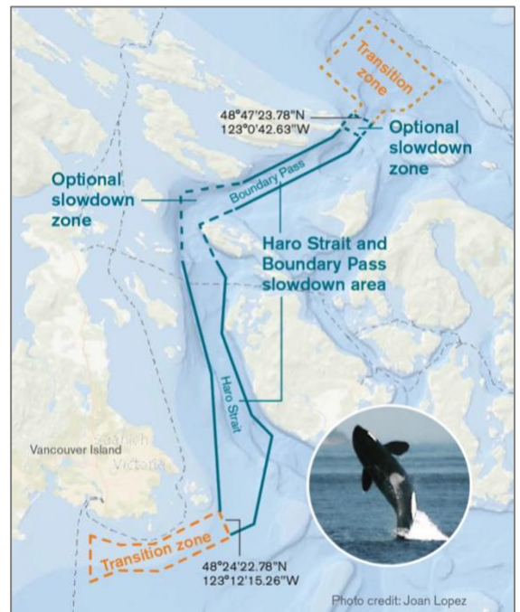
For specific coordinates of the slowdown area, see the full-sized map here .