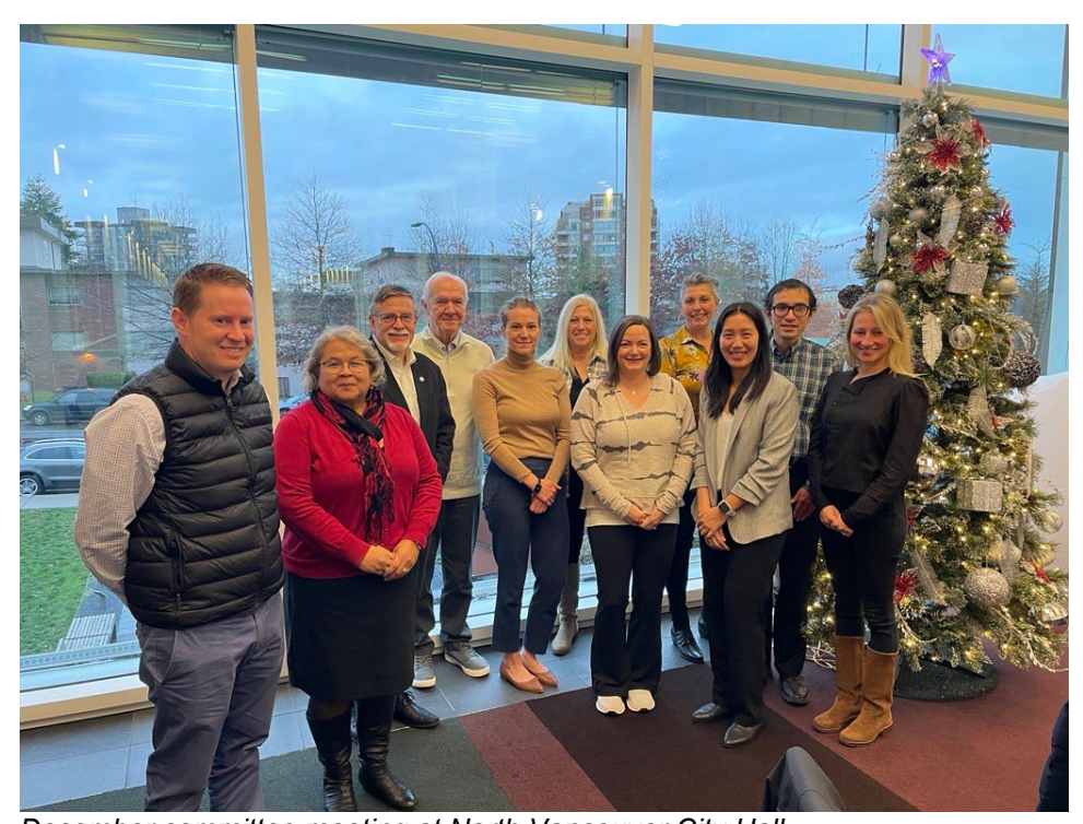
December committee meeting at North Vancouver City Hall