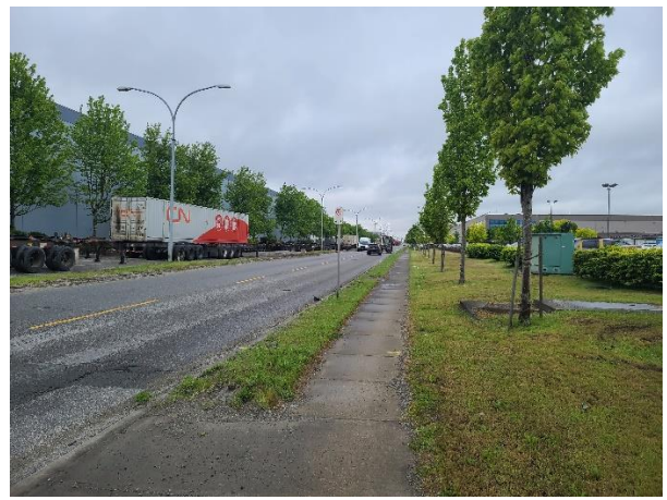
Photograph 3. View west of the treed edges of Blundell Road. Many of these trees are bylaw sized. No nests were observed at the time of survey.