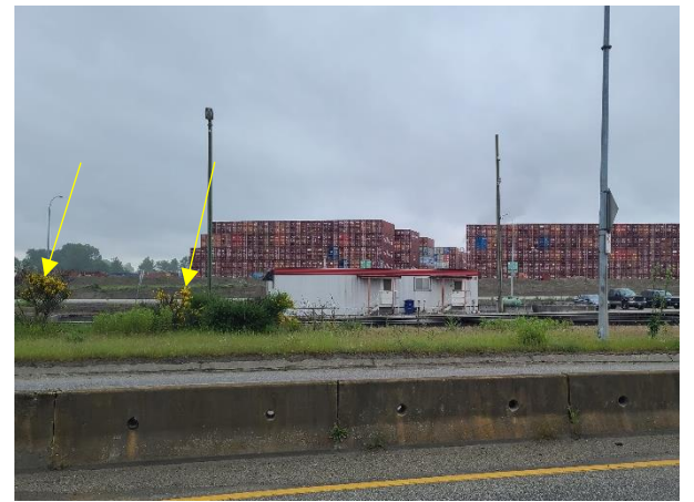
Photograph 1. View south across Blundell Road. Scotch broom within the CN Rail verge is identified in yellow. The sandy edge of Portside Road is visible in the background.