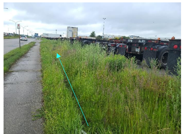
Photograph 2. View west along the north side of Blundell Road, illustrating the herbaceous species present. Many of these species are non-native. The ephemeral ditch is identified in blue.