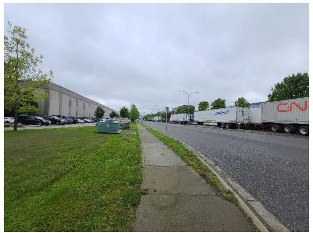
Photograph 4. View west of the landscaped edges of Blundell Road. No wildlife were noted.