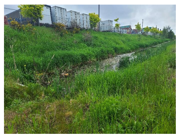
Photograph 9. View south along the ditch east of the No. 7 Canal. This riparian area is outside of the project construction footprint, but is likely connected via stormwater drainage.