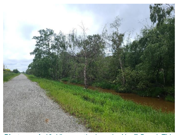
Photograph 10. View south along the No. 7 Canal. This riparian area is outside of the project construction footprint, but is likely connected via stormwater drainage.