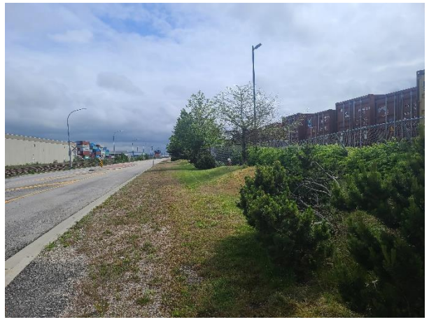
Photograph 5. View east along the south side of Portside Road, illustrating the condition of the landscaped vegetation.