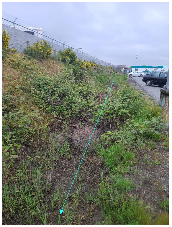
Photograph 8. View east along the ditch and berm at the north side of the Impact Auto Auctions parking lot. No signs of flow were observed. Blackberry and Scotch broom are apparent.