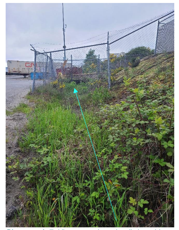
Photograph 7. View west along the ditch and berm at the north side of the Impact Auto Auctions parking lot. No signs of flow were observed. Blackberry is common in this area.