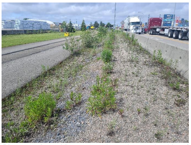
Photograph 6. View west along the south side of Portside Road, illustrating sparse vegetation in this disturbed area.