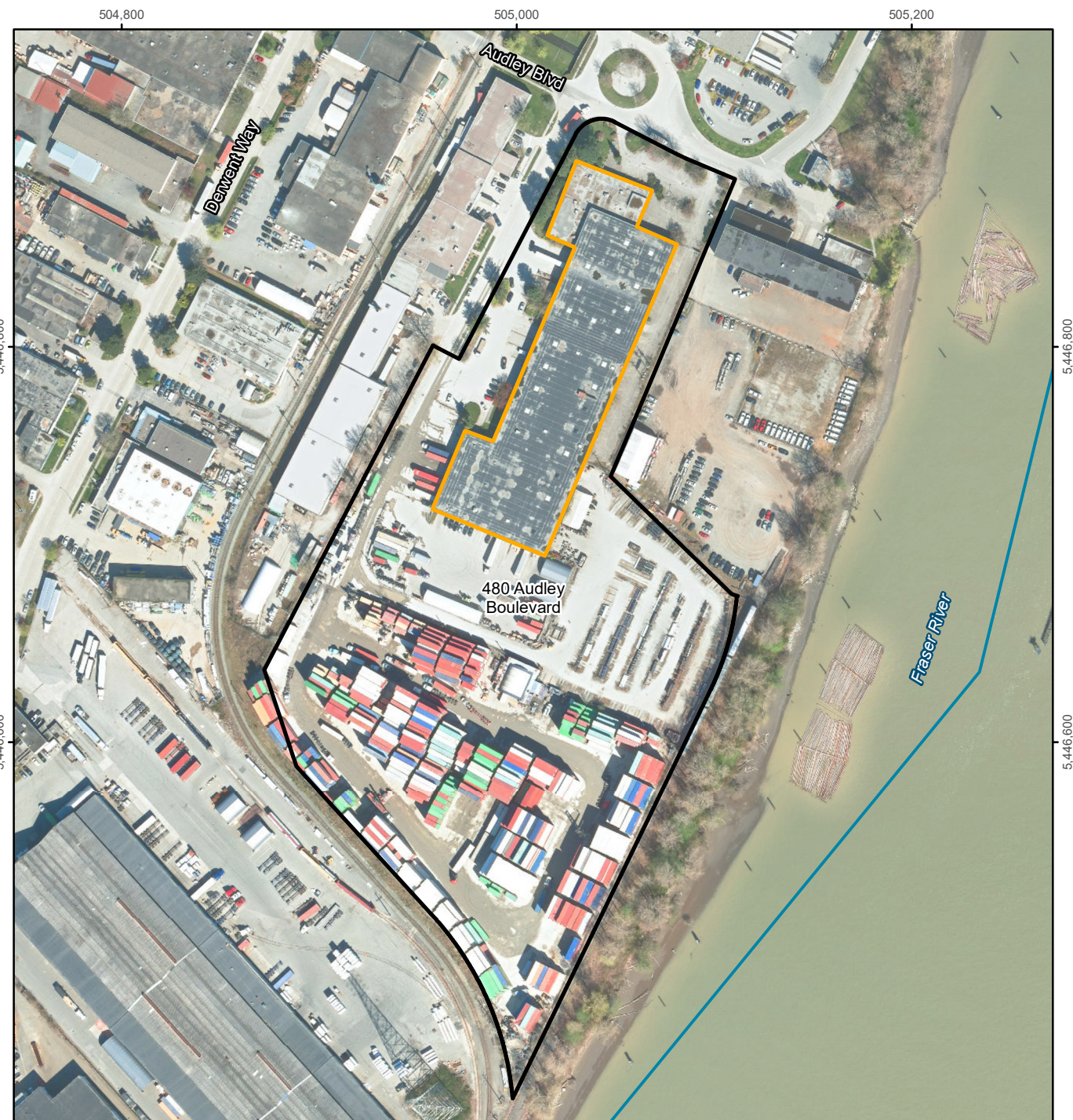
Figure 1 Location plan.