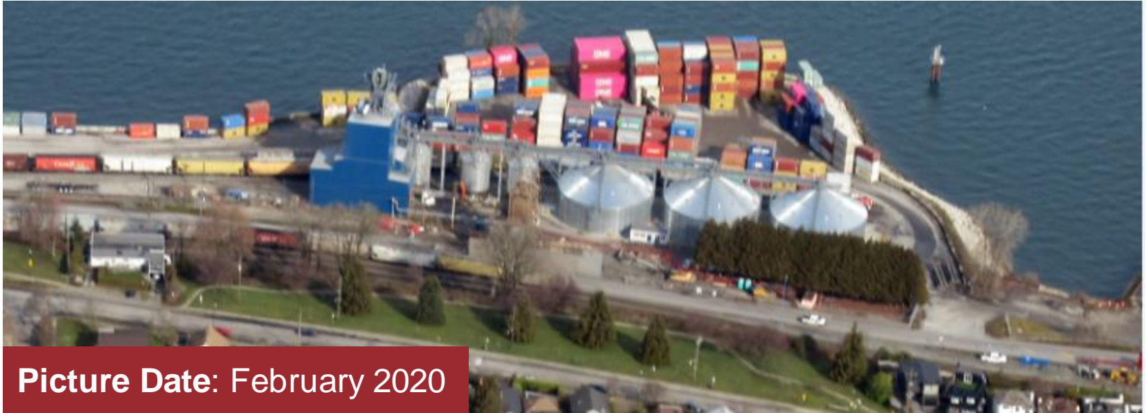
Picture Date: February 2020