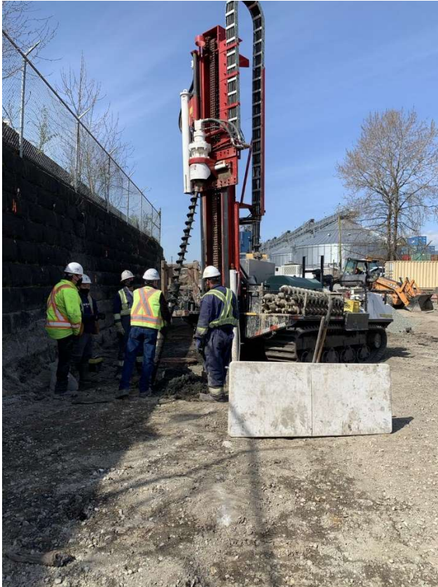
Pictured: Field investigation work along Commissioner Street.