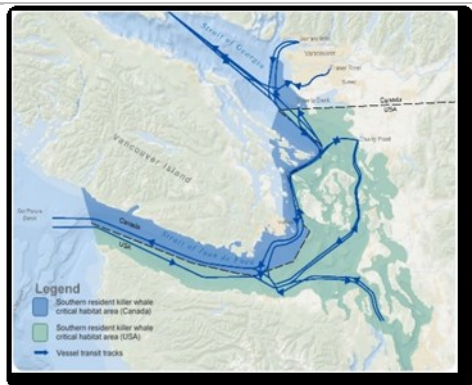
Image: Southern resident killer whale critical habitat and shipping lanes. Navigate with care.