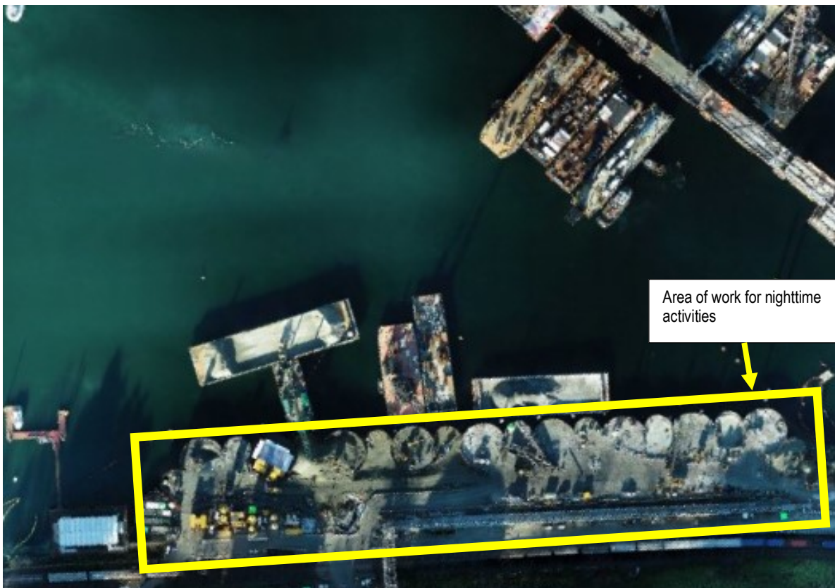
Figure 1: Location of WMT nightwork activities