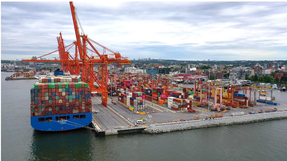
Pictured: A vessel offloading cargo at Centerm

This month, work on the terminal and on the south shore continues.