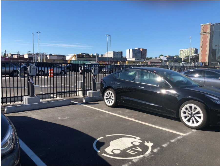
Pictured: New EV stalls on terminal