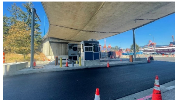
Pictured: New vehicle access control system (VACS) gates under the Main Street overpass