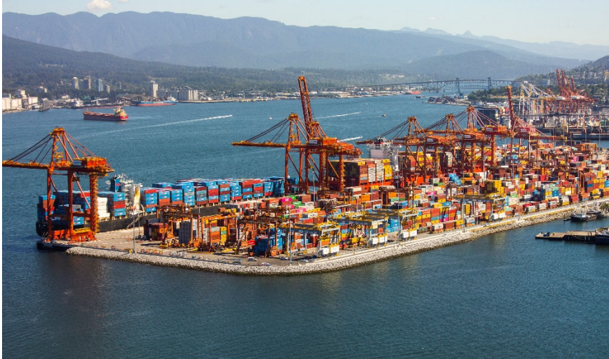
Pictured: Aerial view of the Centerm container terminal

CXP is completing the construction work on these projects.