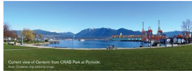
Centerm: Current view

Interested in seeing the full construction schedule? Download the construction activities and timelines PDF