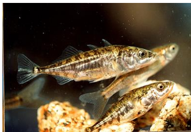
Three-spined stickleback fish

"Seine netting" was used for this particular salvage operation. This method of catching fish involves using a weighted net hung vertically from a rope and attached to buoys at the water's surface.