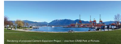
Centerm: Rendering of view following construction completion