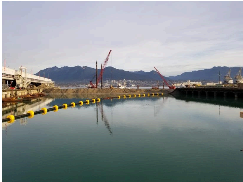
Pictured: The new dyke on the east side of the terminal and the pipe used to transfer sand from the dredging barge into the lagoon.

The yellow buoys you see in the lagoon are part of a long pipe that will carry sand to be put inside the lagoon to create new land. The dredging barge will anchor near the dyke and connect to the pipe. Sand pumped into the pipe will come out on the other end into the lagoon, and new land will rise from the sea!