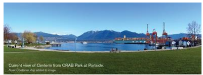
Centerm: Current view

Download the construction activities and timelines PDF