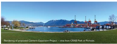
Centerm: Rendering of view following construction completion