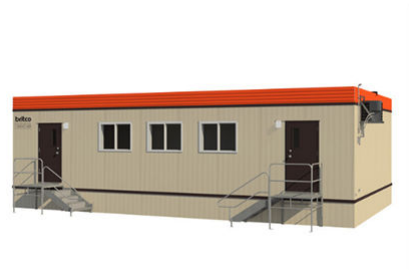
Pictured: Example of construction office trailer that will be brought on site.

In mid-October the construction team will be moving into new modular office spaces in orange trailers on site. These trailers will be located on Burrard Dock, east of the Ballantyne pier.