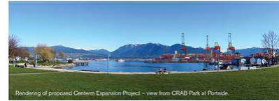
Centerm: Rendering of view following construction completion