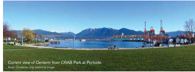
Centerm: Current view

Download the construction activities and timelines PDF