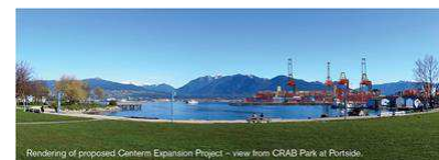
Centerm: Rendering of view following construction completion