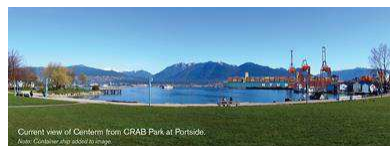
Centerm: Current view

Download the construction activities and timelines PDF