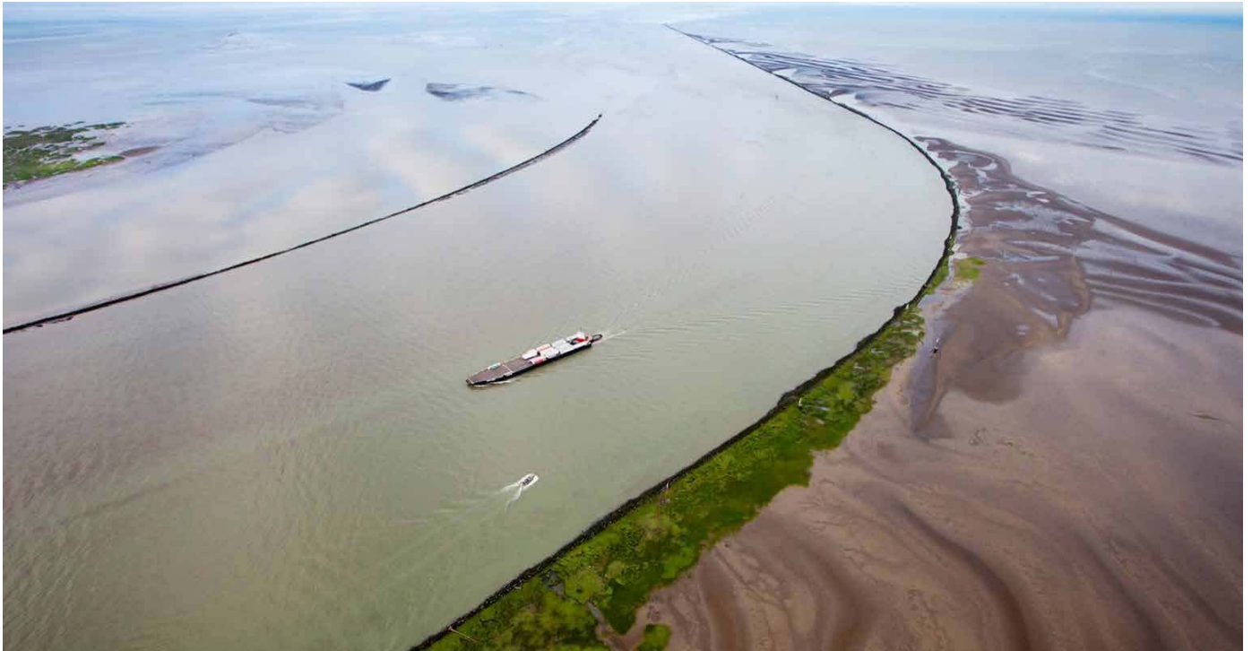
Current state at low tide.