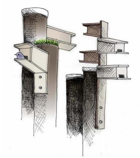
Preliminary rendering of purple martin nest box design