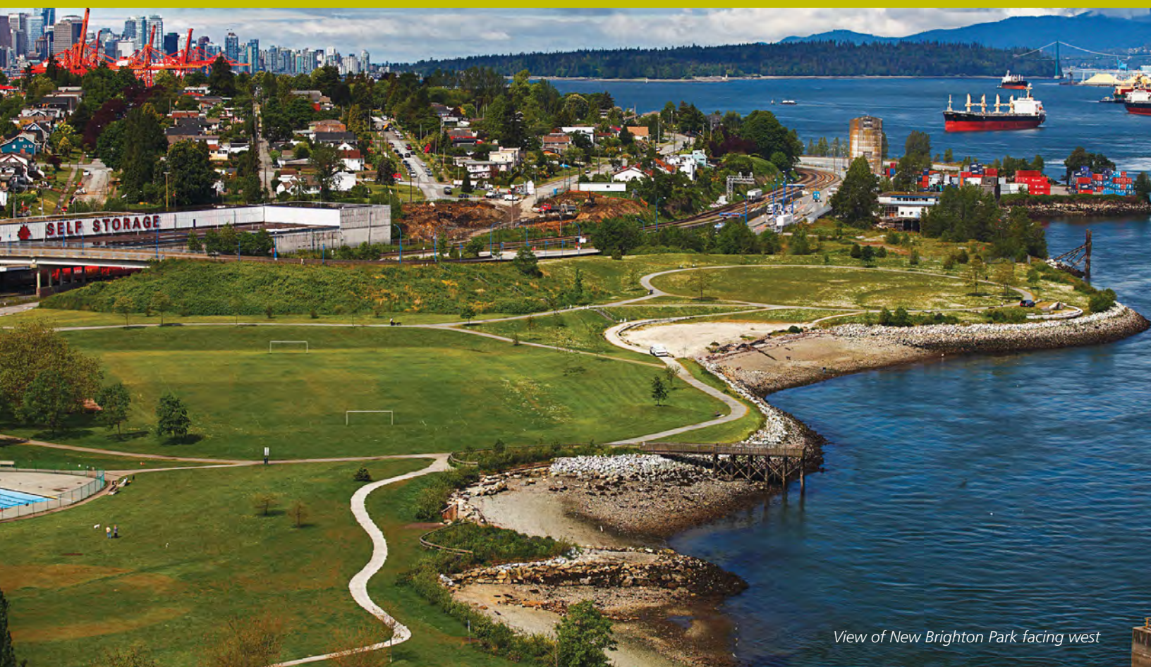
View of New Brighton Park facing west