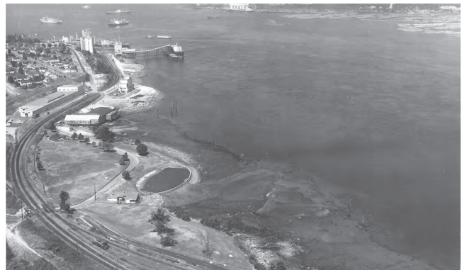
New Brighton Park in 1961, before land filling created the current shoreline. Note that the outdoor pool used to be located next to the shore.

Historical uses of the proposed project site, prior to its development into a municipal park, were primarily for lumber-related industries, particularly shingle manufacturing. A review of aerial photos indicates that the current shoreline visible today was created through fill placement in the 1960s, which resulted in the loss of valuable fish and wildlife habitat.