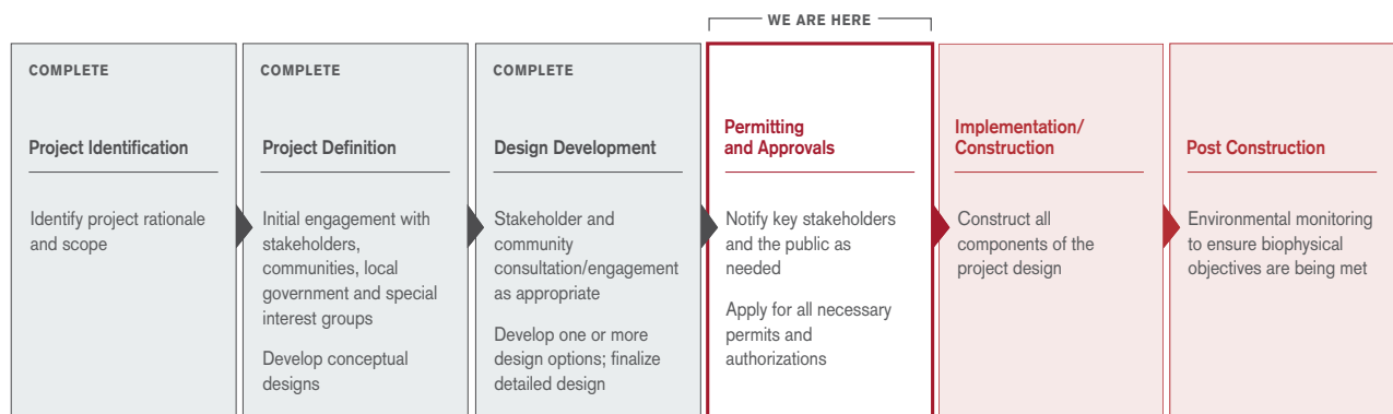
FIGURE 1 Westham Island Canoe Pass Tidal Marsh Project Timeline

At this time, the port authority is advancing this proposed project to the land tenure application stage only. If successful in securing land tenure and if the decision is made to advance to construction, the port authority is committed to continued consultation with key stakeholders on design and other project details. The port authority is also consulting Aboriginal groups through a separate process.