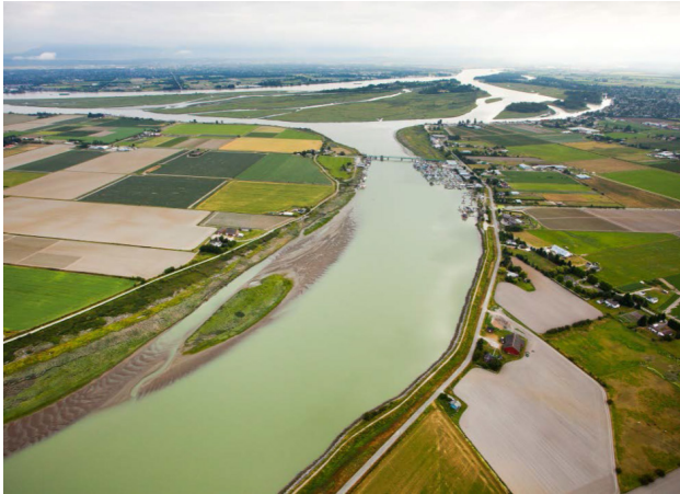
IMAGE 1 Current state at low tide, looking east.