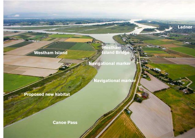
IMAGE 2 Rendering of proposed new habitat at low tide.