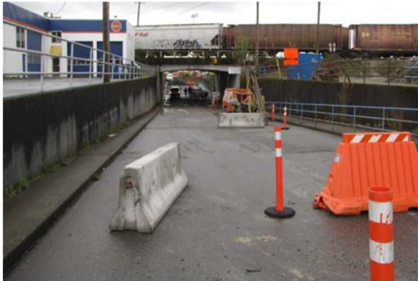
BEFORE [April 2011]