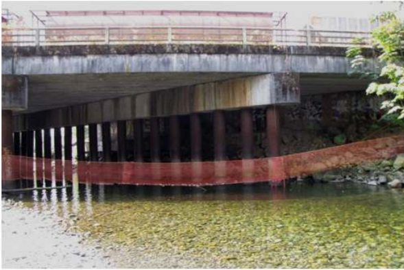
BEFORE [August 2010]