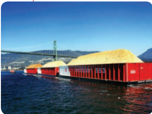
Barging wood chips through Vancouver Harbour

Seaspan International Profile: Serving domestic and international markets, Seaspan International Ltd. began as a small coastal company in 1898 servicing BC’s coastal communities. Since then it has evolved into a prominent marine transportation company serving the West Coast of North America. Today, Seaspan serves domestic and international markets with their fleet of self loading, self-discharging log barges. Seaspan’s chip barge fleet is dedicated to transporting sawmill by-products to pulp and paper mills in coastal British Columbia and Puget Sound. Seaspan caters to the pulp and paper market with a fleet of covered house barges that move product from BC coastal mill locations to local terminals in the Vancouver Gateway. Other services include bulk/general cargoes that are handled by a diverse fleet of flat deck barges, railcar barges that are capable of servicing domestic and international ports and chemical and petroleum barges for the Pacific Northwest market. Seaspan also offers ship docking and escort services and a commercial roll on-roll off ferry service through Seaspan Coastal Intermodal. Learn more about Seaspan International. Read more.