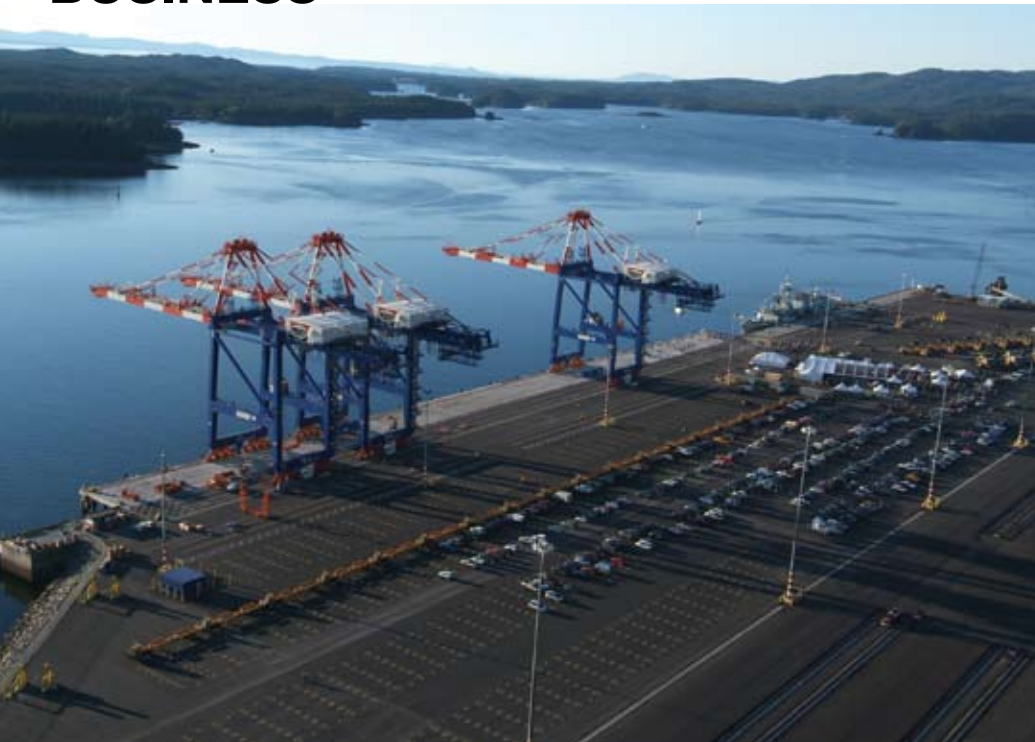
The Port of Prince Rupert's Fairview Container Terminal was officially opened on September 12, 2007.